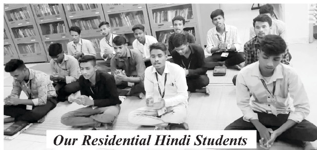
Our Residential Hindi Students

We hope you are doing well by the grace of God. We are upholding you through our continuous prayer and supplication. God will surely do great things in your life in the coming days. Believe Him for a miracle today!